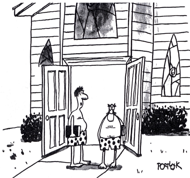
"That was the best sermon on giving I've ever heard."