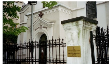
National Evangelical Church of Sofia

There has been an Armenian Evangelical community ever since the early nineteen hundreds and presently there are six Armenian Evangelical & Methodist Churches in the cities of Burgas, Plovdiv, Russe, Shumen, Sofia and Varna.