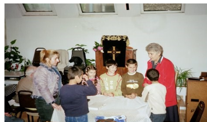
Sunday School Children of Armenian Evangelical Church of Sofia

The Sunday we were there was the last Sunday of the Sunday school. At the end of the service the kids gathered around a table (picture), by the altar, and in a question & answer session demonstrated what they had learned during the year.