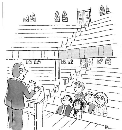
"God calls us to evangelism! The bank that holds our mortgage has mentioned it, too."

Church-wide Prayer Meeting: Los Altos 1st Thursday every month.