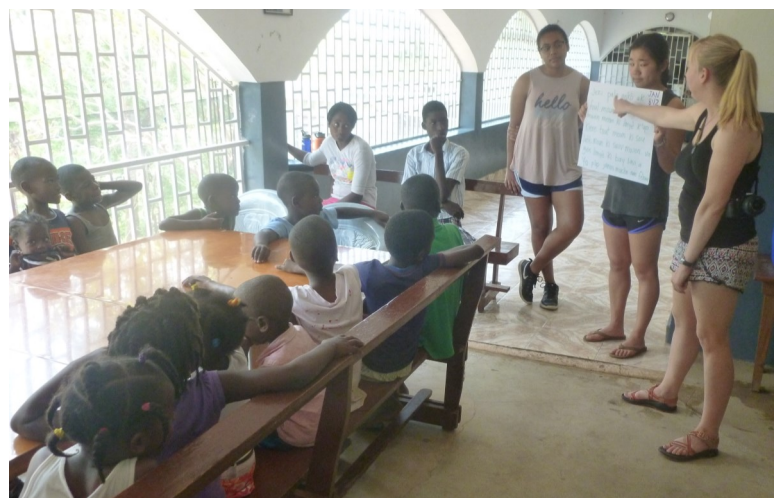
Vacation Bible camp in Haiti, teaching kids about the death and resurrection of Jesus, and its meaning for their salvation.