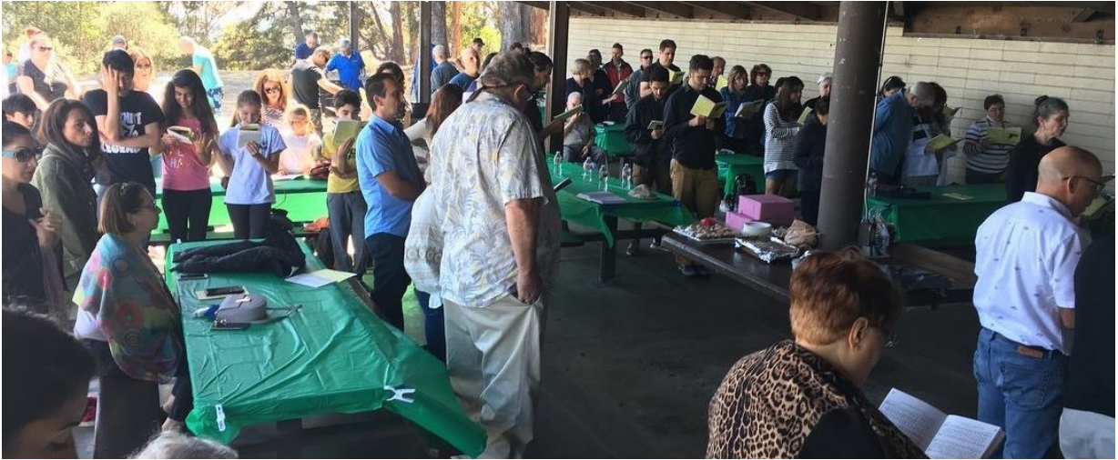
We had a wonderful day at our annual church picnic with worship, fellowship, food and games.