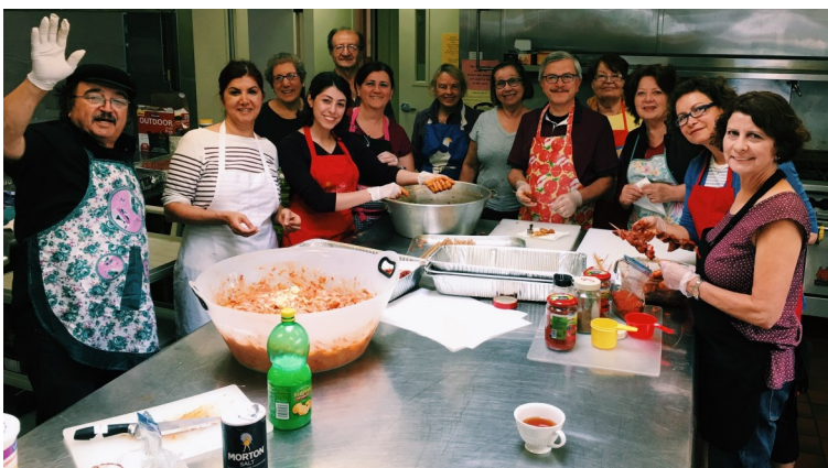
Tireless workers preparing for the picnic