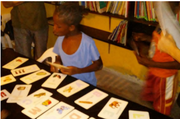
Kids in Haiti using the new library with donated books; reading and learning outside of school.

I want to say a special thank you to all the volunteers that helped during the week, whether teaching or preparing food or just spending time with the kids, your contributions were much appreciated. Let's continue to work as a church to share the gospel with the community around us, and especially with the next generation.