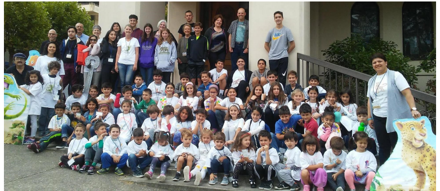
Vacation Bible Camp Photo