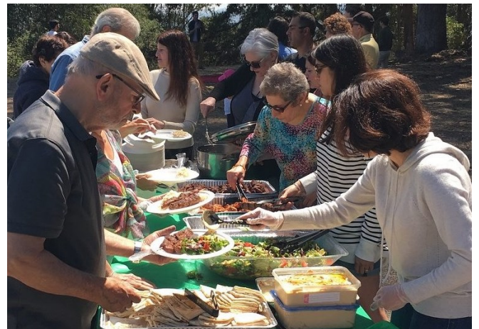
Thank you for serving us.