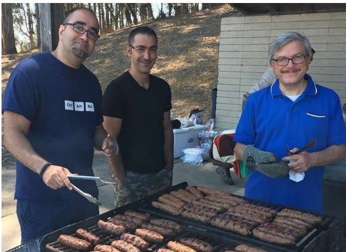
Thank you for your hard work!