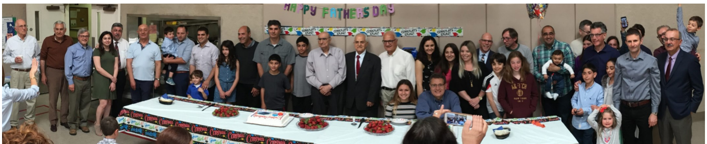
Fathers and Children on Fathers Day