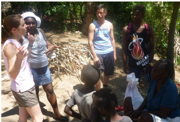
Delivering food to needy families who would otherwise go hungry.